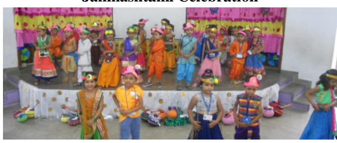
Celebrations for the joyous festival of Janmashtami were organized for the students of classes 1 to 5.