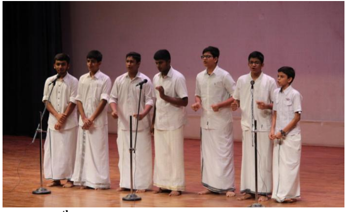
29<sup>th</sup> School Foundation Day - BEATS (Blissful Evening with Anandalaya's Teachers and Students)

The School Foundation Day was celebrated on 11<sup>th</sup> July 2017 with approximately 100 students from classes 9 to 12 availing of the opportunity to showcase their talent through the medium of performing arts. A variety of programmes ranging from clap dance to classical Bharatnatyam to cupsong were presented by students at the T.K.Patel Auditorium.