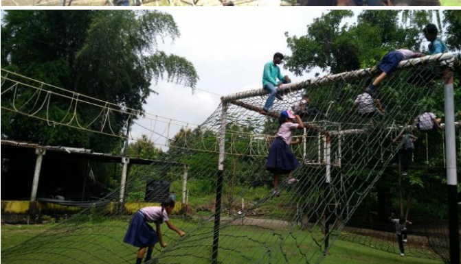
On 9<sup>th</sup> September 2017 a trip to Vanachal was organized for students of classes 1 and 2 and batches on 9<sup>th</sup> September 2017 and 11<sup>th</sup> September 2017.

Under the OEEP programme, a trip to Vanachal was organized for classes 1 and 2 on 9<sup>th</sup> September 2017 and for classes 3 to 5 on 16<sup>th</sup> September 2017.